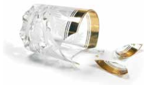
✔ Broken glass

General waste goes straight to landfill. Avoid products that cannot be recycled or have excess packaging. Use this bin only for waste that cannot be recycled.