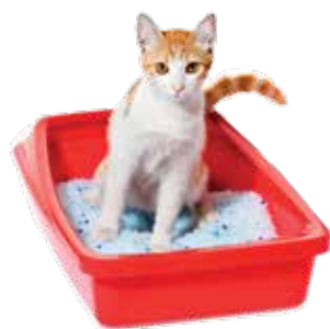
✔ Kitty litter (including biodegradable)