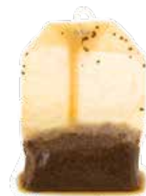
✔ Coffee pods and tea bags