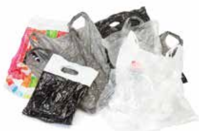
✔ Soft scrunchable plastics