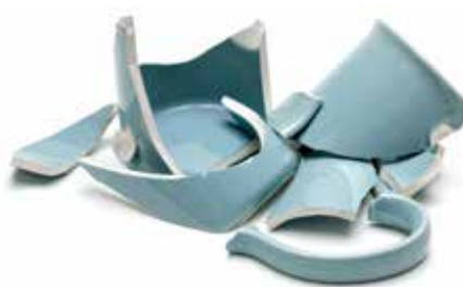
✔ Broken ceramics