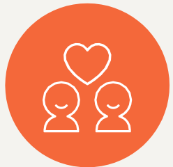
Respectful and safe