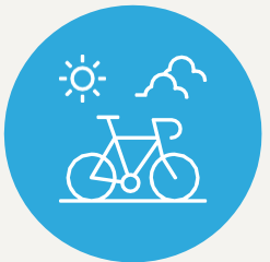
Healthy and active