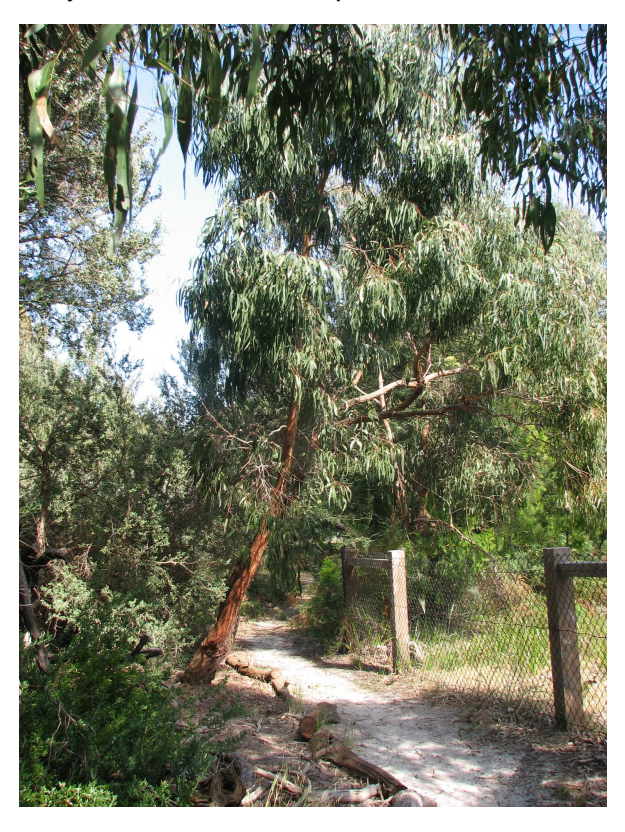
Bayside Environmental Sustainability Framework (ESF) The Tree Strategy conforms with the intent and direction of the ESF.

During the MSS review, the Bayside community is being consulted to identify issues that are important to the future character of the City. The consultation process reinforced that: